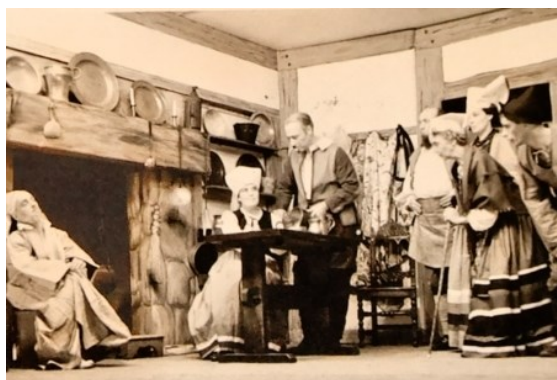
A Husband for Breakfast, January, 1941

This past month I have spent time looking back through the scrapbooks, and thought I would share one of the strange features of some of the sets from the early days of our group; that some of the single room sets include a ceiling! I have attended hundreds of theatrical productions over my lifetime, and I don't think I have ever seen set with a ceiling. It is an interesting quirk of style that seems to have come into style then gone back out again during the early part of the 1940s. It only appears in photos from 1941 to 1943.