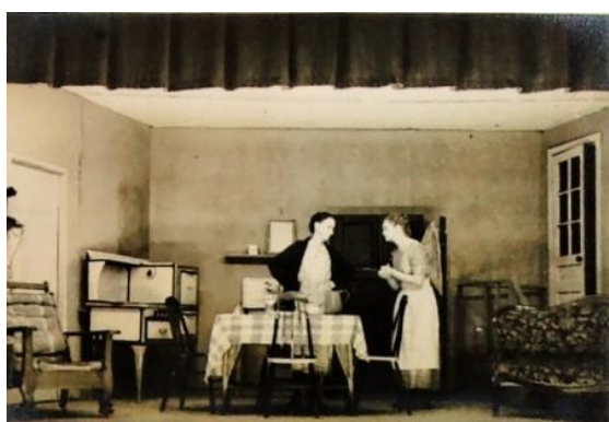
The Undercurrent, March, 1941