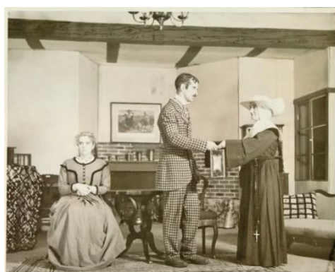
Lady in Retirement, April, 1943