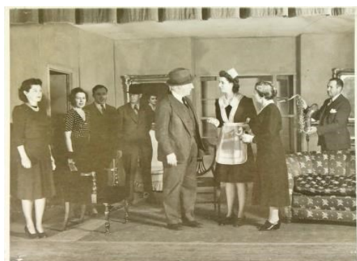
Heaven Can Wait, March, 1943