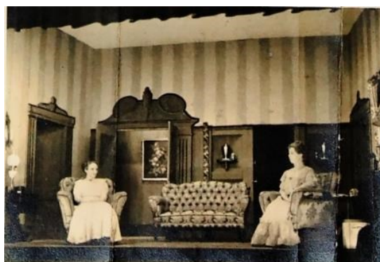
The Double Door, February, 1941