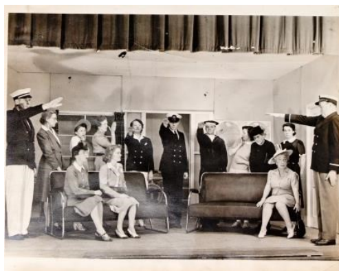
Incognito, October, 1942